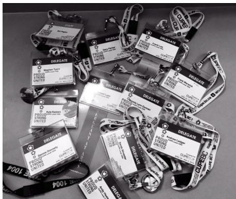
CUPE 1004 delegate badges

CUPE 1004 sent 11 delegates to the convention. This number was based on the amount allowable by CUPE BC based on number of members within the local, and our locals has 3500+ members, which entitled us to 11 delegates, The following delegates were sent on behalf of CUPE 1004: